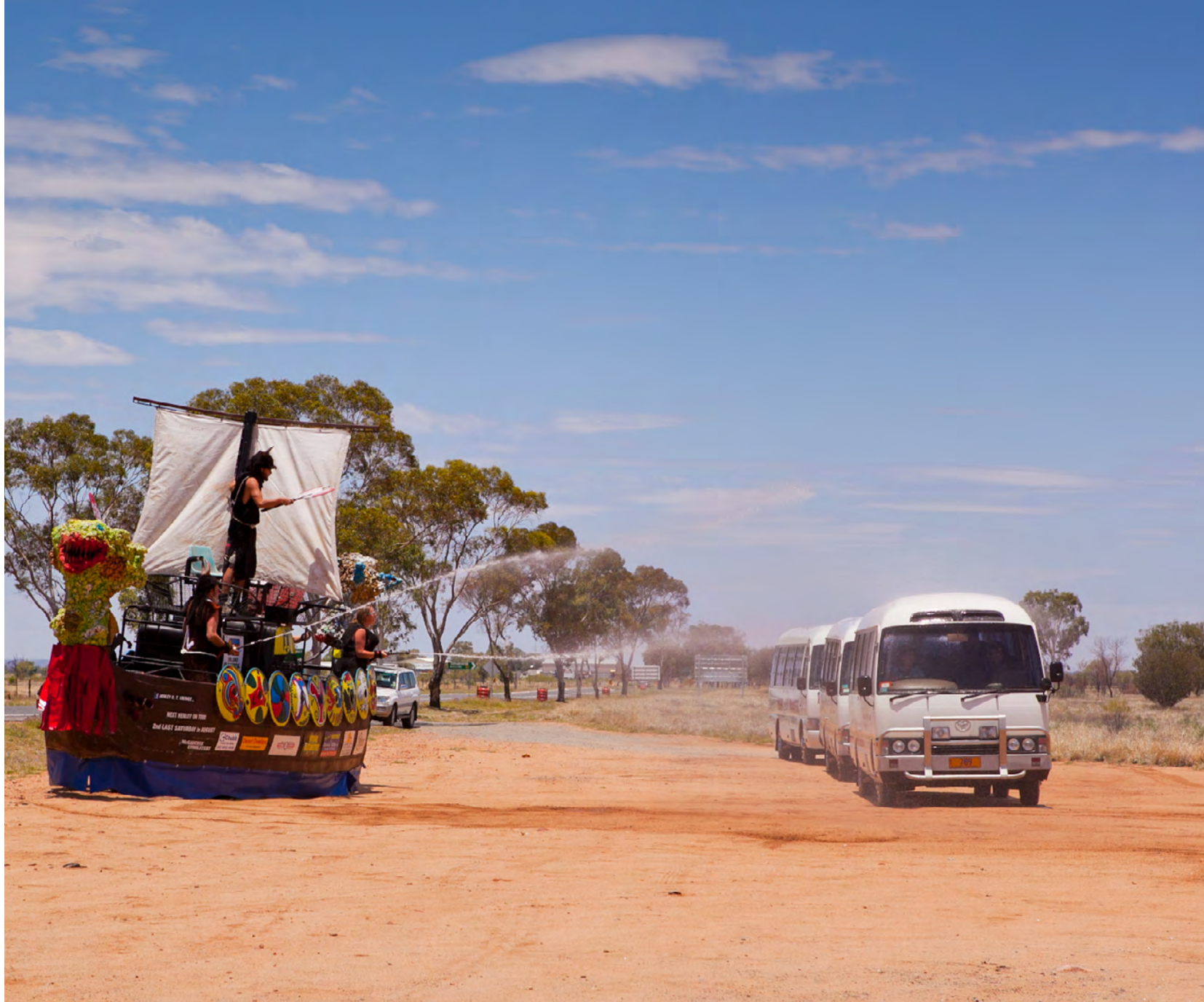
Image: Desert Vikings arrival in Central Australia

From managing security and safety protocols to handling unforeseen logistical issues, event managers can navigate through challenges seamlessly, ensuring the smooth operation of your event.