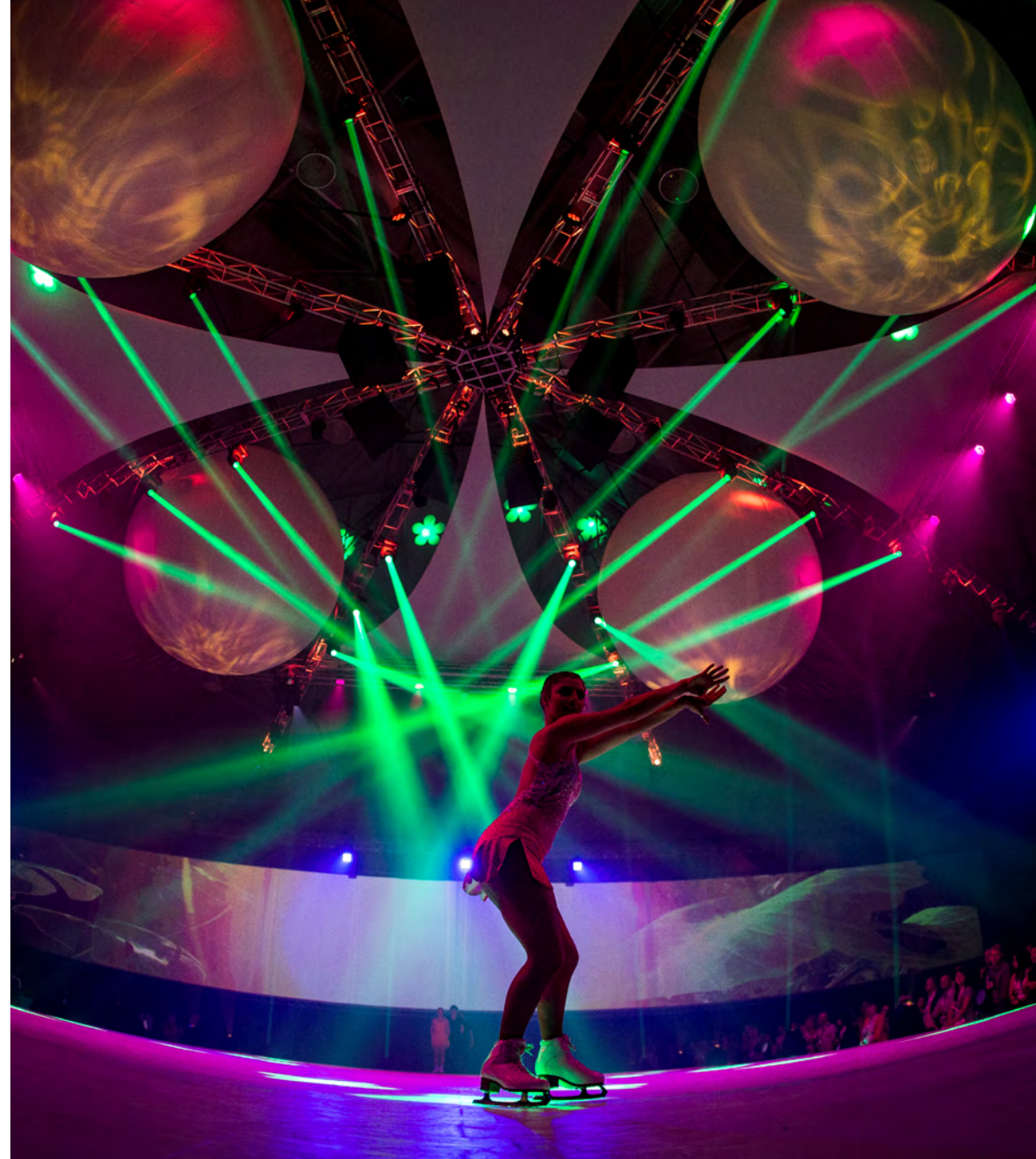
Image: Welcome Event - Skating Show, Australia