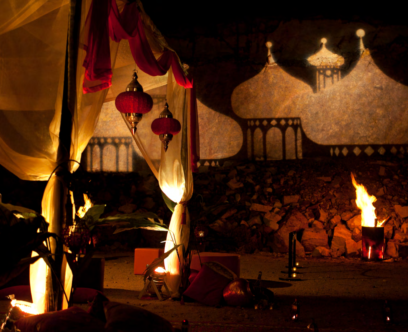
Image: Arabian Nights at The Quarry, Alice Springs Australia