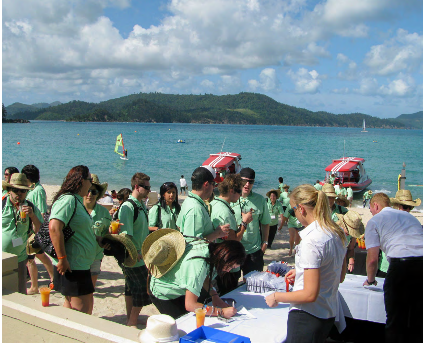
Image: Stealth Arrival on Hamilton Island, Australia

Event managers excel in time management, creating detailed timelines and schedules to ensure that every aspect of the event is executed efficiently. They also have established relationships with vendors, allowing them to negotiate contracts and secure the best services and pricing. With their expertise in resource management, event managers can help you optimise an assigned budget and allocate resources effectively, maximizing the impact of an event.