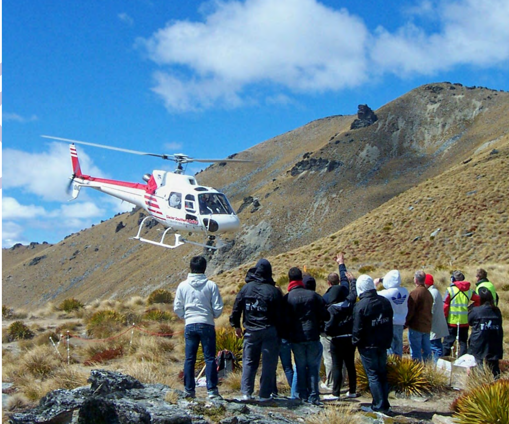
Image: Helicopter drop off on Coronet Peak, Queenstown New Zealand

When it comes to planning and executing a successful event, the role of the professional event manager cannot be overstated. Here are several key reasons why hiring such a professional is essential...